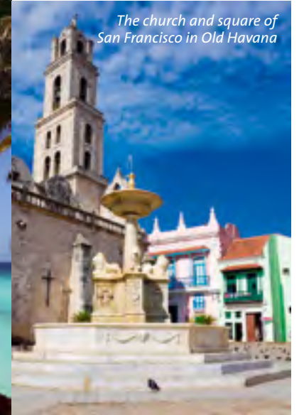
The church and square of San Francisco in Old Havana