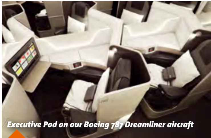
Studio Pod on three-cabin Boeing 777-300ER aircraft

Our Studio Pod is featured on services from London Heathrow to Vancouver all year round and to Montréal from 1 May to 1 October 2015.